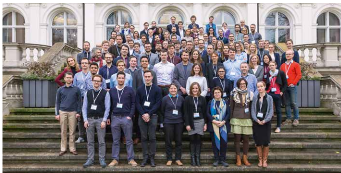
BIH Charité Clinician Scientist Retreat 2018

All Calls are advertised and can be applied for via: www.bihealth.org/en/news/calls/